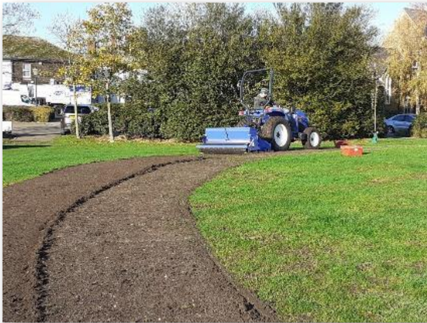
Photo 5 –Machine bulb and seed sowing in November at Queenborough.