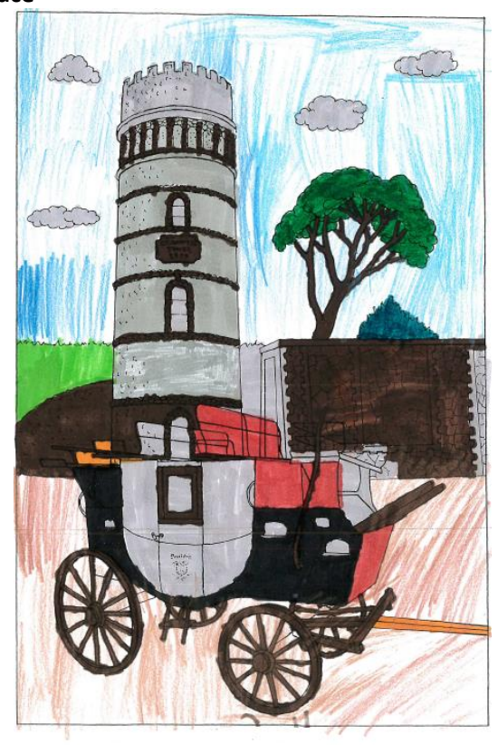
Crampton Tower Museum and The Broadstairs Stage Coach